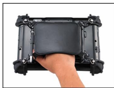
Hand strap (included)